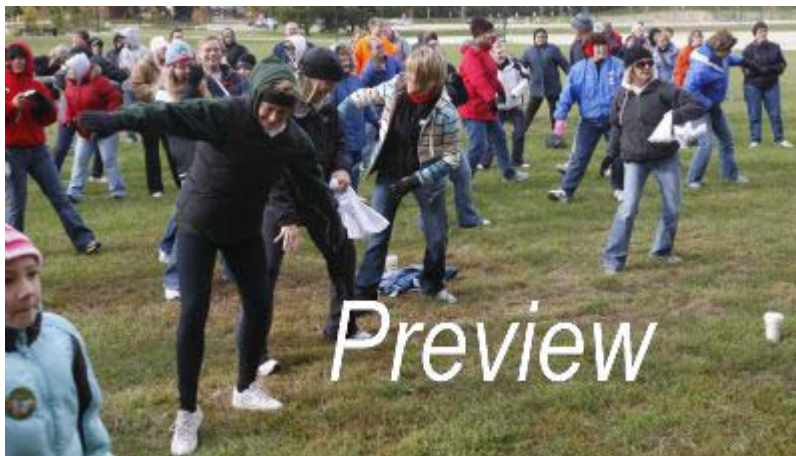
Caption: Walkers get a chance to warm up with a mild aerobic session with the ladies from Xtreme Fitness of Kasson. Album ID: 861188 Photo ID: 26120043